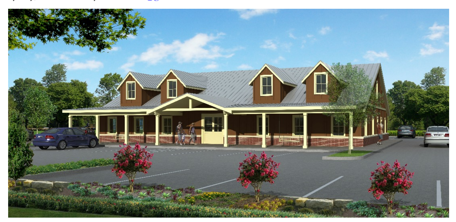
Architectural rendering of the new building to be located at 265 Wetz Street, Seguin, TX

We are currently selling "bricks" (symbolically) to support this initiative. Gifts of $100 or more will be included in a visual display on the wall at the new center. If you are interested in being a part of this project in any way, contact Christy at cwilliams@gccac.net or 830-303-4760.