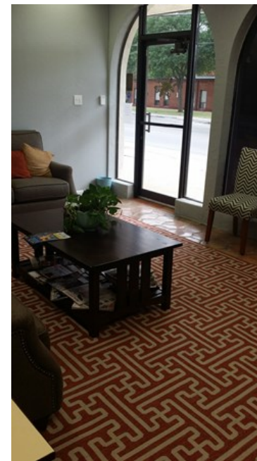
Waiting room and front door

We've had positive feedback and appreciation from our clients and MDT members about the convenience of the new location. One mom remarked that they don't have to take the kids out for an entire day of school, which is very helpful.