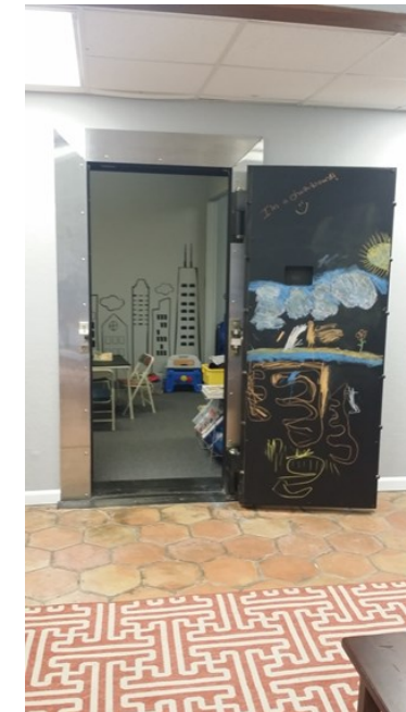
View from waiting room into game room