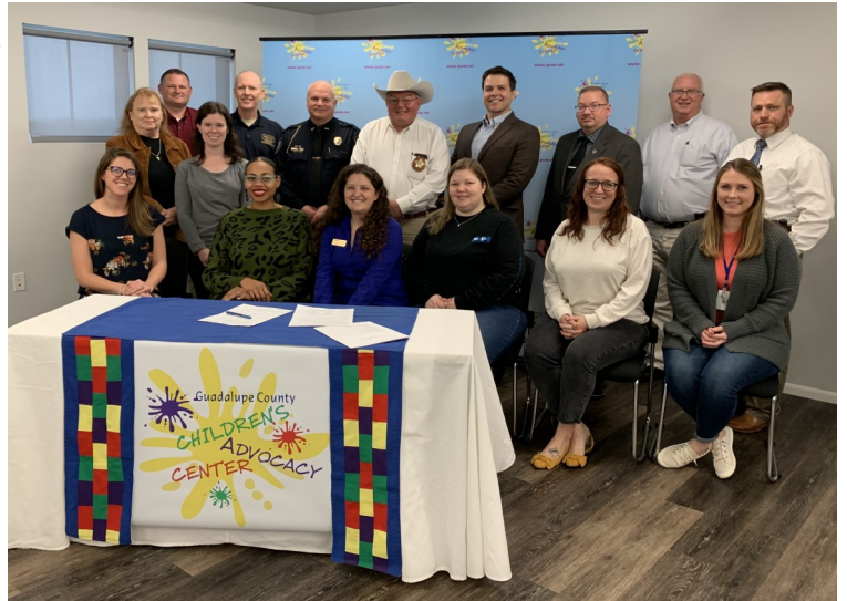
MDT leaders and GCCAC staff present for protocol signing

On February 19th, team leaders from our partner agencies in law enforcement, Child Protective Services, and prosecution came together to sign updated versions of our Multidisciplinary Team (MDT) Protocols and Interagency Memorandum of Understanding (MOU). Our MDT partners include the Guadalupe County Attorney's Office, Guadalupe County Sheriff's Office, Cibola, Marion, New Braunfels, Seguin, Selma, and Schertz Police Departments, the Department of Family and Protective Services, Guadalupe Regional Medical Center, and CASA of Central Texas. These agencies have been working together for over 15 years to reduce trauma on children and families as they move through the investigation process, as well as build stronger cases. We are extremely thankful for these partnerships and all of our team members past and present who have helped the GCCAC continue to work toward our mission and serve children and families in Guadalupe County.